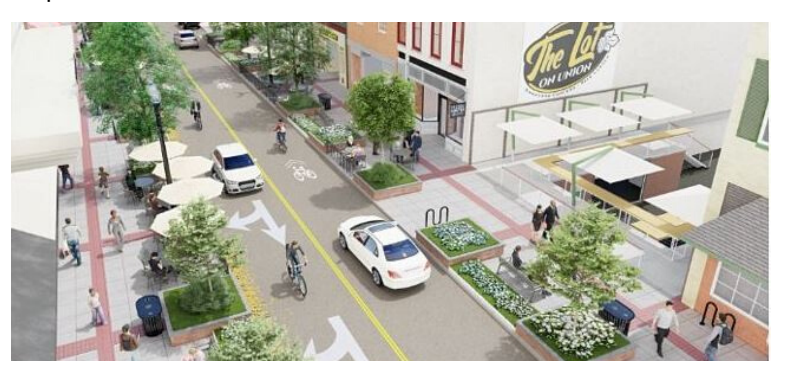
For more information, go to: concordnc.gov/Departments/Planning/Planning-Services/Downtown/Union-StreetScape

The New Union StreetScape is a Council-driven, community informed, and collaborative plan to redesign Union Street in downtown Concord. The plan includes 22' wide sidewalks, 11' travel lanes, 15 parking spaces (including two new ADA accessible spaces), sharrow markings, poured concrete sidewalks with brick paver accents, added landscaping, new smart light poles, space for public art and outdoor dining, designated loading/unloading zones, and vehicle drop-off zones. This project is a joint effort that stretches across Planning, Transportation, Water, Stormwater, and Electric departments.